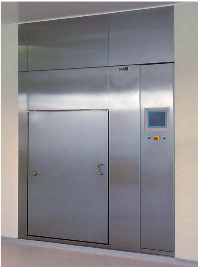
Depyrogenation oven loading side with semi-automatic door

The particle test is to be performed during a complete cycle, heating, sterilizing and cooling