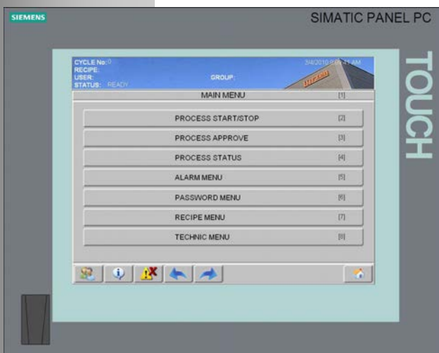
Lytcon with Siemens panel

The printer report layout consists of two separate printer reports. Report number 1 (monitoring signals) contains raw data not used by the control system.