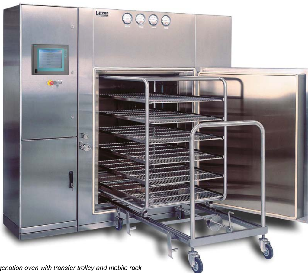
Depyroge-nation oven with transfer trolley and mobile rack

The water cooling element is a continuous welded unit. It is pressure tested and is expected to last the life time of the depyrogenation oven. There are no joints in the water piping inside the depyrogenation oven boundary.