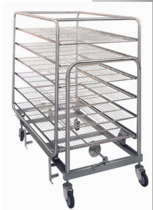
Transfer trolley and mobile rack

Mobile rack, wire trays and cassettes are always in stainless steel AISI 316.